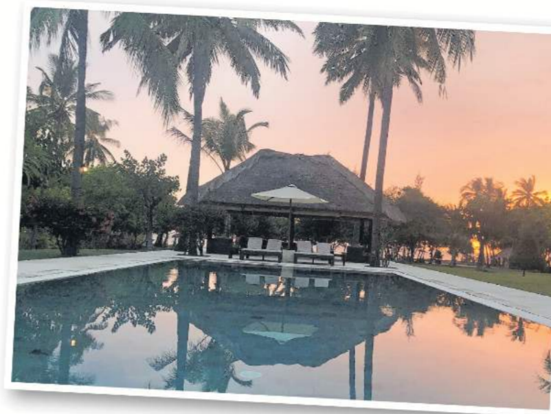
Sunset at Villa Sepoi Sepoi.

its former use as a cattle farm. But if you were expecting humble and traditional, think again. It's about as modern and swanky as it gets — bedrooms hidden behind secret doorways, a 4m diving pool, a dedicated