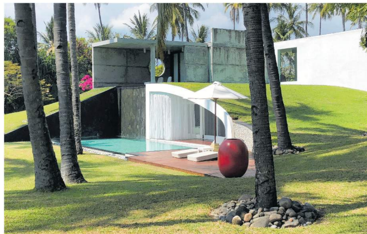
Villa Sapi.

T he blast of the heat on my pasty skin, the "shhh" of the ocean in my ears, the smell of fresh frangipani as leis is looped around my neck, the taste of a refreshing welcome iced tea and the sight of a grinning line of uniformed staff lining up to welcome me — I'm not sure my senses can take any more of it! I'm in northern Lombok being ushered into the grounds of Villa Sapi and the rock star welcome is only the start of it. I'm about to sample a lifestyle usually reserved for people with plenty of cash to spare. And I mean the type of cash which means you can buy yourself a